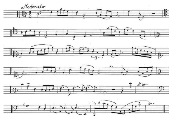
Figure 2: An example of final examination from an Italian conservatory.