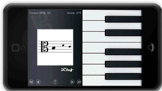
Figure 3: The interface of iClef .