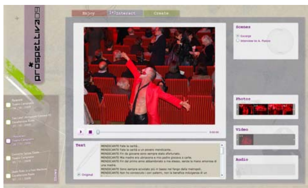
Figure 7. The Interact section.

First, this section gives to the Web audience some of the features typical of a live fruition, such as the possibility to change the point of view and to concentrate on a particular type of content, chosen by the user and not imposed by a director. Moreover, this model provides a sort of augmented reality if compared to a live view of the performance, since the elements mixed up on the stage can be enjoyed together - and from different perspectives - or even ungrouped and watched one by one. This possibility is particularly relevant for the shows with multimedia projections, which sometimes present an information overload very difficult to decode in real time.