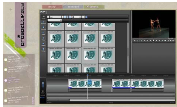
Figure 8. The Create section.

It is worth noting that the obtained results can be noticeably heterogeneous. As a trivial example, short clips with advertising purpose can be realized; but a more creative use of this tool can originate brand new forms of art, for example by mixing zoomed particulars from still images, extrapolating single words, breaking audio contents into small pieces and editing them in an original manner, and so on. In other words, through this section each user can communicate his/her own perspective on a show, thus recalling the name itself of the festival, namely Prospettiva09 .