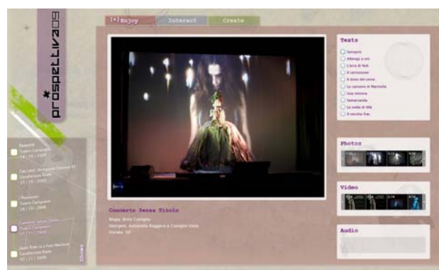
Figure 6. The Enjoy section.

Figure 6 shows a screenshot of the interface.