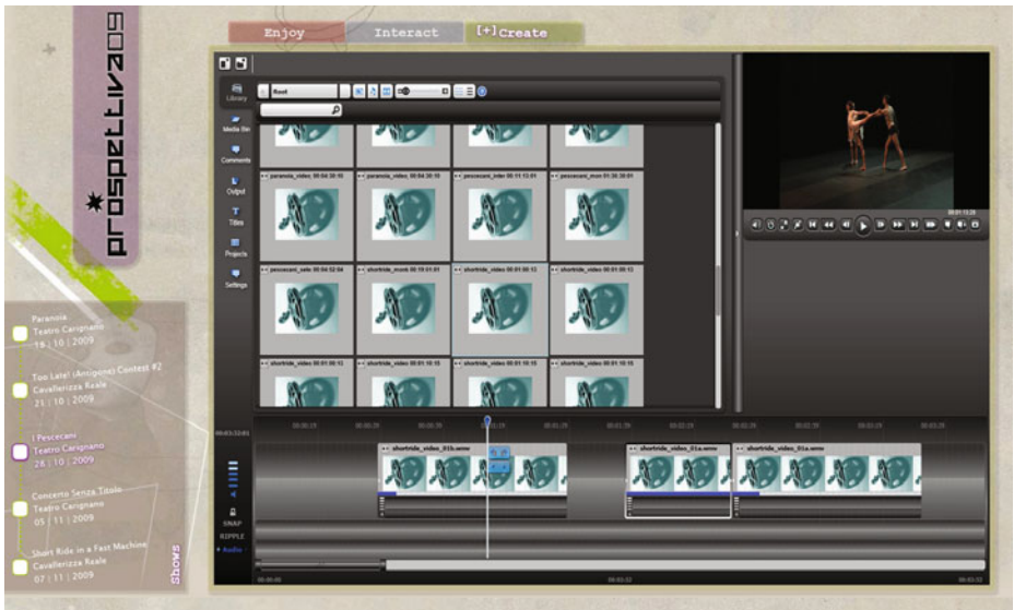
Fig. 6. The Create section

so on. In other words, through this section each user can communicate his/her own perspective on a show, thus recalling the name itself of the festival, namely Prospettiva09 .