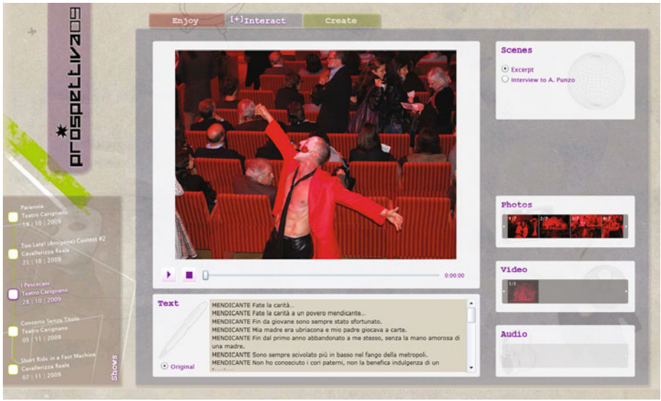
Fig. 5. The Interact section

so on. In other words, through this section each user can communicate his/her own perspective on a show, thus recalling the name itself of the festival, namely Prospettiva09 .